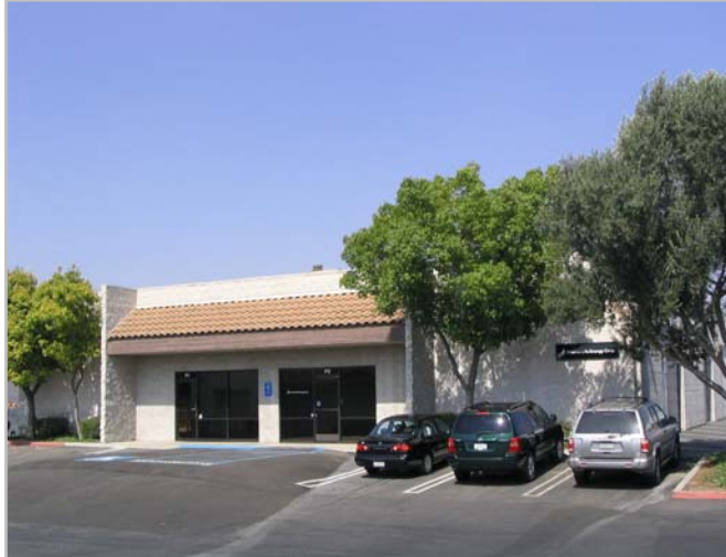
Thermo Life™ Energy Corp. Laboratory location in Riverside, CA

Advantages of the new developed technology: