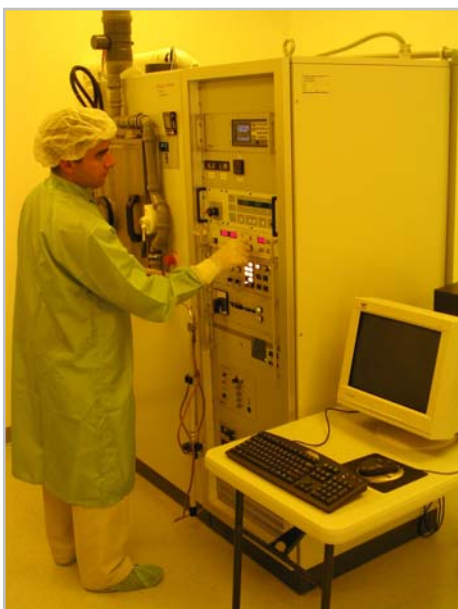
Thin film high vacuum deposition equipment

The Thermo Life™ generators are based on the development of a unique thin film technology for the deposition of highly efficient thermoelectric materials of the \text{Bi}_2\text{Te}_3 -type on thin Kapton foils, which originated at the Martin-Luther-University in Germany and were advanced and developed at the D.T.S. Company in Germany. This technology consists of five general steps: